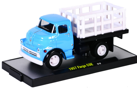
Example of “M2 Truck” The tires on this truck will fit the rims that we sell for “M2 Truck Tires”.