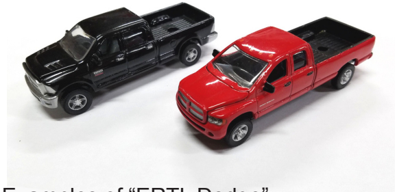
Examples of “ERTL Dodge” Left depicts 2011 - 2018 Ram 2500 Right depicts 2003 - 2009 Ram 2500

Each Jensen Diecast pickup truck rim set is sold “per set”, as in 4 rims for 1 vehicle. Tires are not included with the rim sets as these are designed to be used with tires made from existing vehicles. Currently (8/11/2020) our rims are designed to fit either “ERTL Dodge tires” or “M2 truck tires”. It is stated online which rim fits which tire. Examples of the vehicles utilizing these tires are shown to the side.